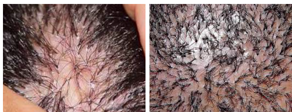
Figure 2: Exclusion: non-active FD: cicatricial alopecia.