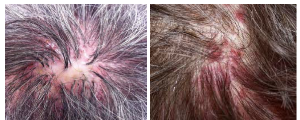
Figure 1: Inclusion: active FD: papules, papulo-crust or pustular lesions.

Our group of patients has a male predominance observed in other studies as well. In patients with FD minocycline is our first choice, usually in monotherapy. In some non-responsive patients we associated rifampicin or clarithromycin. The main reason for the study is that minocycline use is associated with hyperpigmentation [22,23]