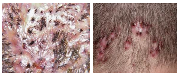
Figure 3: Disease activity measured by number of papules, papulo-crust or pustular lesions.