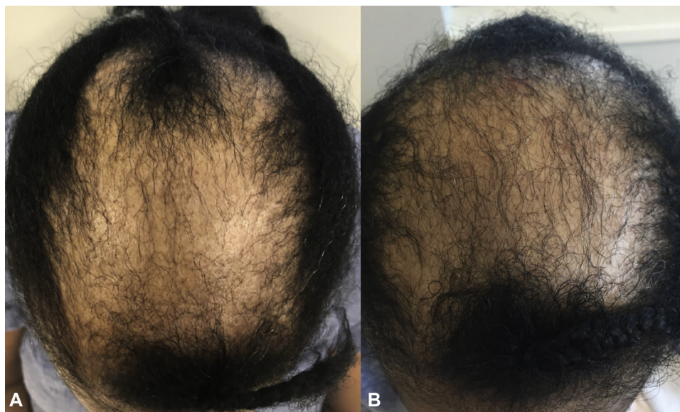
Fig 2. Improvement of central centrifugal cicatricial alopecia after application of topical metformin in case 2. A , Central centrifugal cicatricial alopecia in patient 2 before initiation of topical metformin. B , Hair regrowth after 4 months of topical 10% metformin treatment.

keloids. We previously published results that showed a 5-fold increase in the occurrence of uterine fibroids in women with CCCA compared with age-, race-, and sex-matched control individuals. 4 Furthermore, research has shown preferential expression of fibroproliferative genes in patients with CCCA. In a microarray study, PRKAA2 , a gene that encodes for AMPK, was found to be